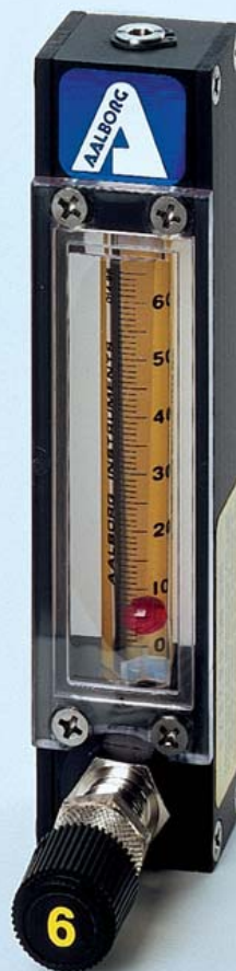
65 mm Meter with MFV™ Valve