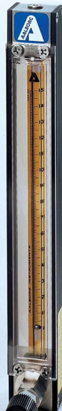
150 mm Meter with CV™ Valve